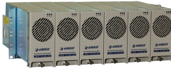
Unit Shown: LMHF-75-48V with Modules & Shelf