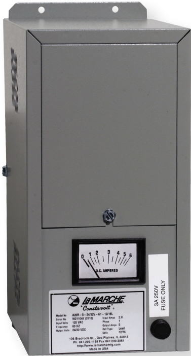
Model Shown: A18J-3-12V-A1